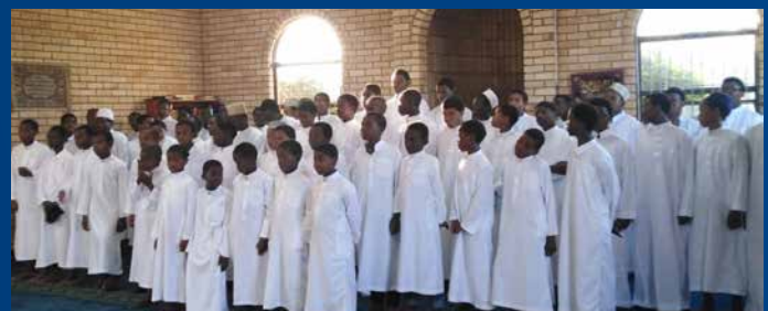
Eid Kurtas for orphans