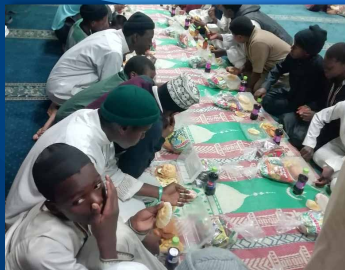
Serving of Iftar Meals at Orphanages throughout the 30 days of Ramadan

As a businesswoman you juggle your packed schedule between the emails, long distance calls, WhatsApp messages, long hours at work and the extensive humanitarian endeavours of Ramadan. From serving Iftar meals to hundreds of Rozgars on a daily basis to buying Eid gifts, clothes & goodies for orphans and deprived children, to distributing food packs to the underprivileged so that they don't have to worry about getting food on their tables during the holy month.