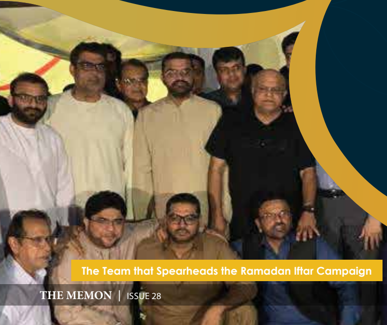
The Team that Spearheads the Ramadan Iftar Campaign

We implore you to delve deep into the bountiful spirit of giving and brotherhood during the blessed month, contribute towards the worthy cause of the Ramadan Iftar Camps and join us on the Arabian coast as we unite to break bread with our brethren in the Middle East.