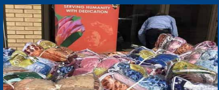
Blanket Distribution Drive during the devastating floods that struck Durban and the East coast of South Africa.