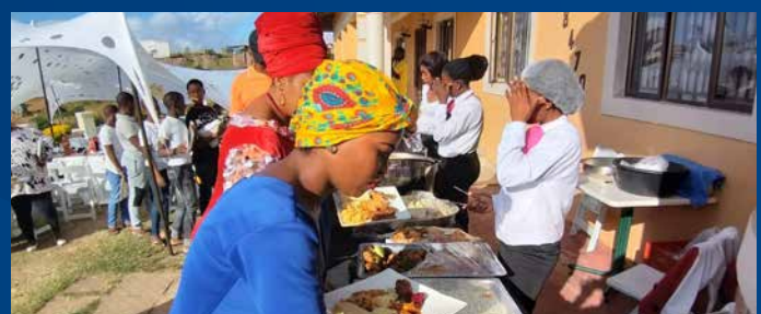
Special Feast for the Marginalized to Celebrate the Joyous occasion of Eid