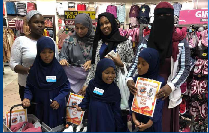
Eid Hampers for Children

Mother, Daughter, Wife, Grandmother, Entrepreneur, Businesswoman, Humanitarian.....Leader.