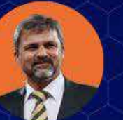
MR. MOIN KHAN EX-CAPTAIN PAKISTAN CRICKET TEAM CEO-DHA SPORTS CLUB MOIN KHAN ACADEMY