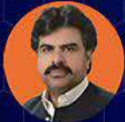
MR. NASIR HUSSAIN SHAH PROVINCIAL MINISTER OF SINDH FOR LOCAL GOVERNMENT