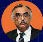
MR. SHABBAR ZAIDI CHAIRMAN FEDERAL BOARD OF REVENUE